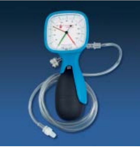
Hand Pressure Gauge