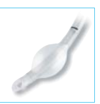
Lo-Contour<sup>™</sup> low pressure cuff